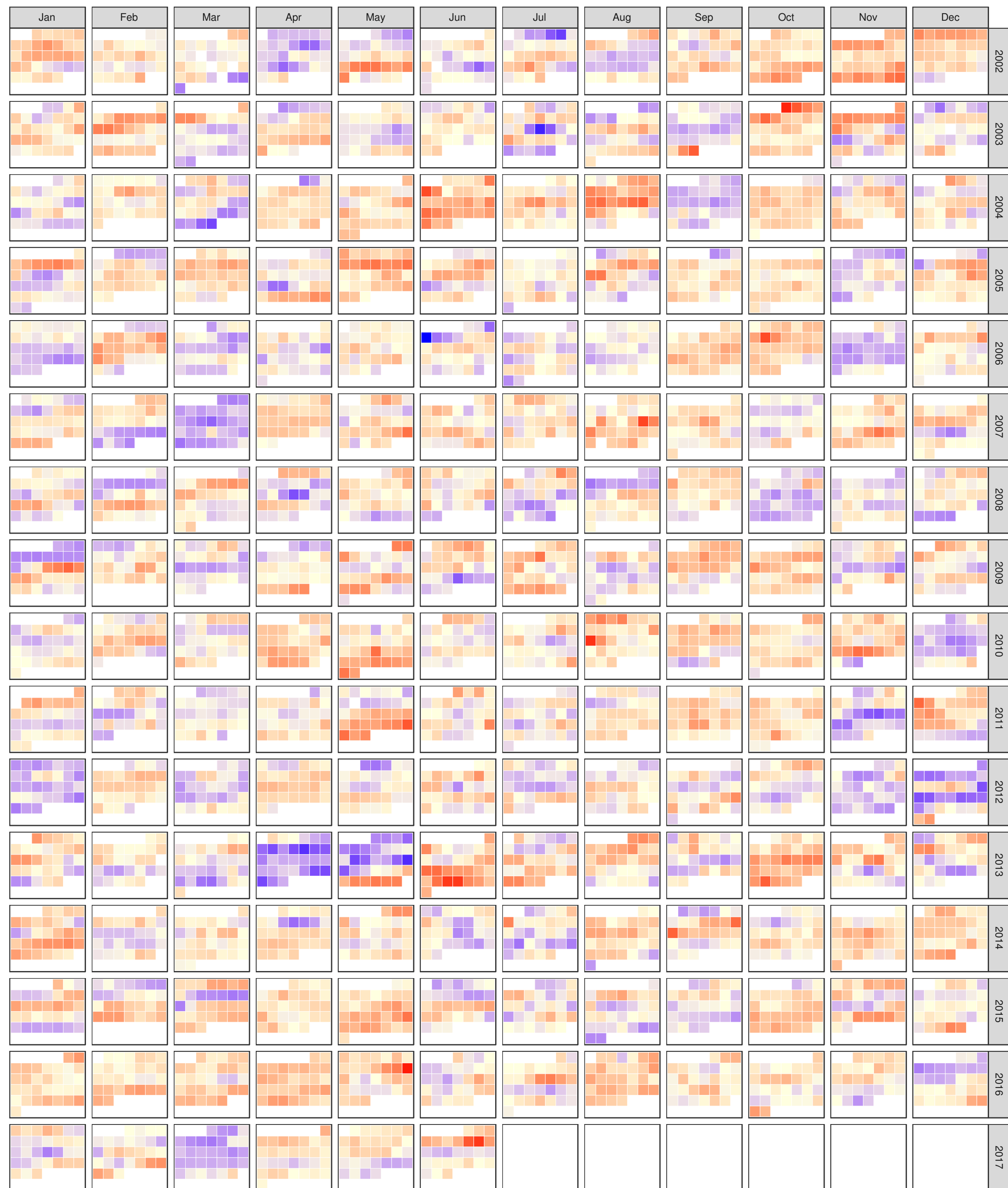
Normalized difference between daily mean temperature and 30-year average