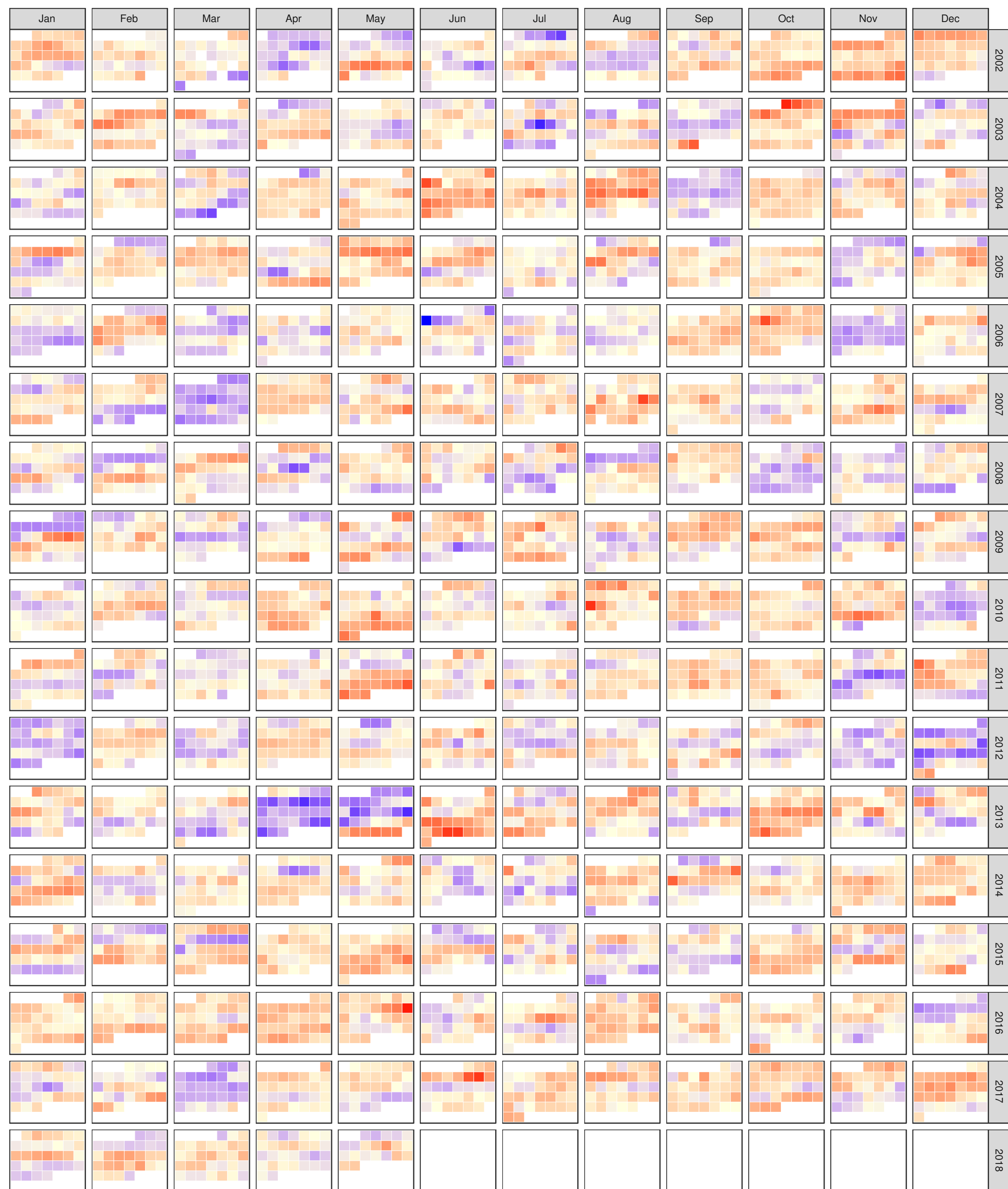
Normalized difference between daily mean temperature and 30-year average